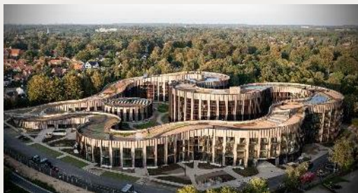
Lyngby - Denmark