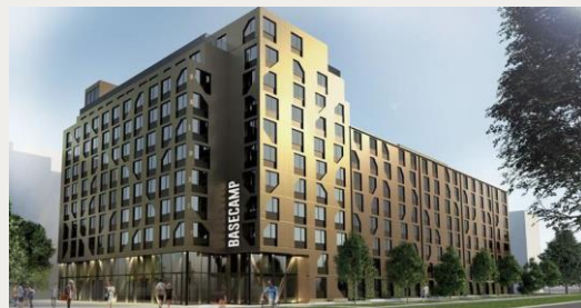
Malmö - Sweden